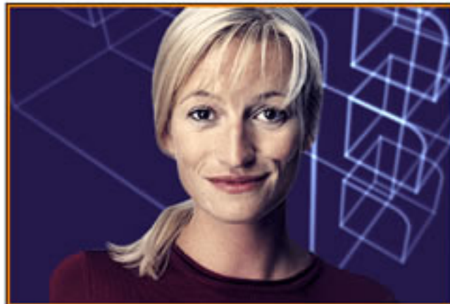
A Portrait on the Home Page

Different portraits are offered in the download section. Detailed picture parameters are available for shooting (see below) if additional portraits are needed.